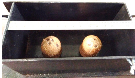
Figure 2: Placing of coconut shells in the mould

shells. We removed the mould after 24 hours, cured the blocks by immersing in water for 28 days and found the compressive strength. The photograph of the bottom portion of the hollow concrete block is shown in Fig. 3.