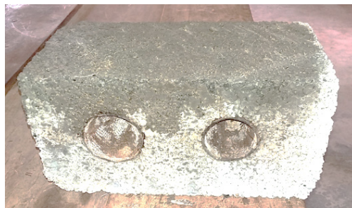
Figure 3: The photograph of the bottom portion of the moulded open graded hollow concrete block