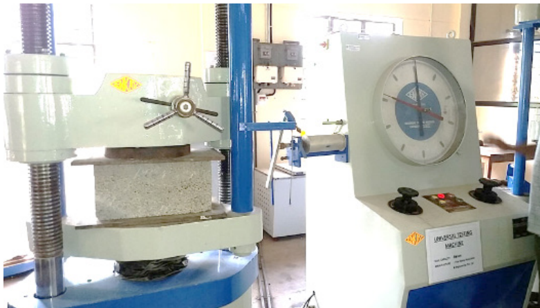
Figure 4: Testing of hollow concrete block

in the market was found to be 6.17 N/mm 2 . Hence, results shows that the compressive strength of hollow concrete blocks increases by reinforcing it with the coconut shell. The water absorption of our designed hollow concrete blocks was found to be 7.8%. As per IS 2185 water absorption of hollow blocks should not be over 10 percent by mass. Hence water absorption of hollow concrete block reinforced with the coconut shell is satisfactory.